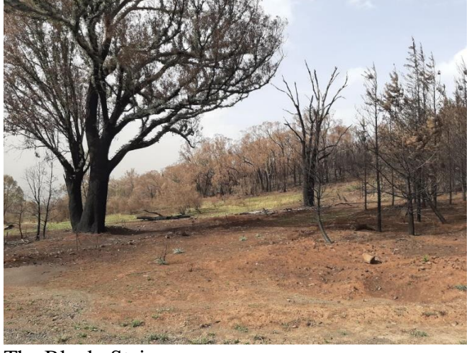
The Block, Steiner.