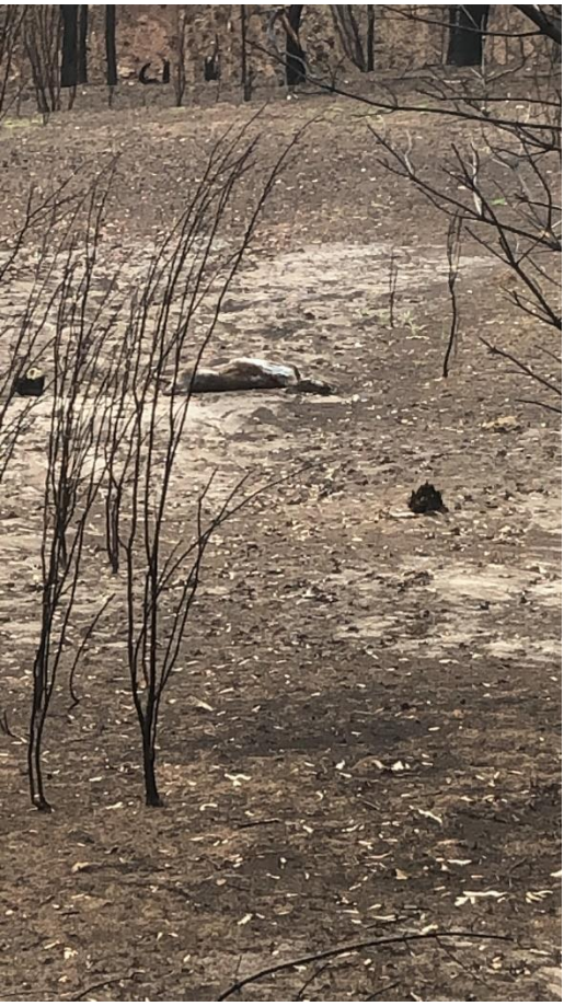
Here lies the body of a burnt fallow deer.