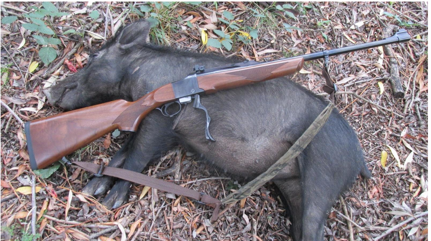
Dan with one of two pigs shot with his .303 single shot. The rifle is fitted with an aperture site. Four pigs were sighted and Dan waited until they closed to 70 metres. The first pig went straight down with a single round and the rest scattered. A young boar stopped to look back at around 90 metres and was dispatched with another shot. The aperture sight proved very easy to use and more accurate than Dan expected.