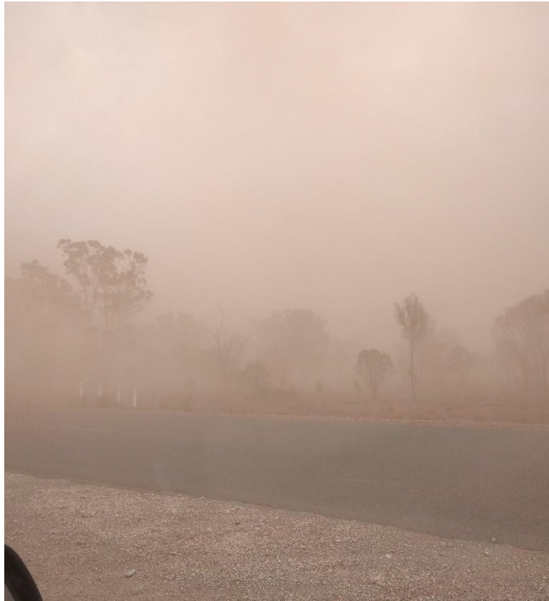
Dust storm- at times the other side of the road couldn't be seen.