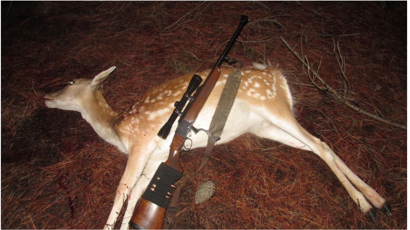
A Fallow deer shot just on dark with this Ruger No.1 in 7x57 using a 140gn Woodleigh projectile.