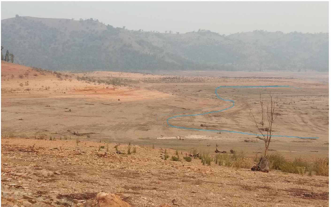
This is an interesting photo of Wyangla Dam. The blue line represents where we were trolling 12 months ago. The water line had receded at least 100 metres over 2019. Let's hope the next 12 months brings enough rain to top the dams up a bit.